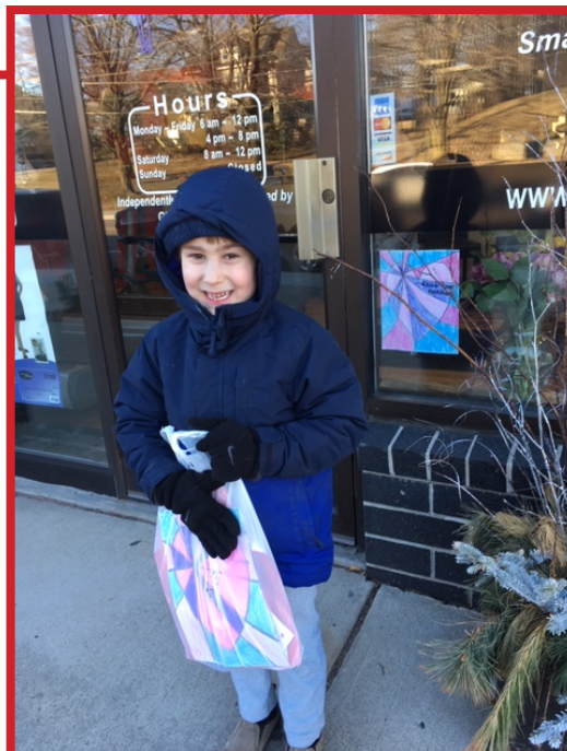
An Eliot student delivering hearts around Needham.

I hope everyone has a wonderful February break. I plan to spend the week at home, resting and hanging out with my family. We may even spend a day at the Museum of Science at the Omni theater and Planetarium. Enjoy the break and we will see you again soon!