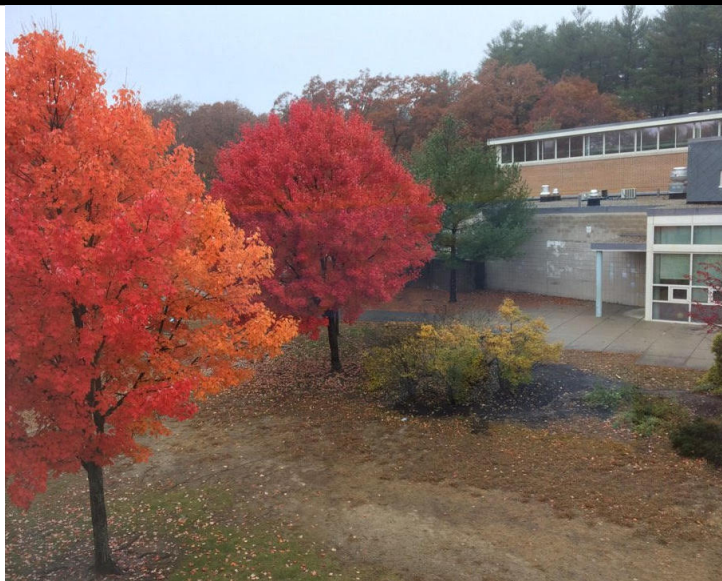
A view of the colorful trees in our playground, during the month of November.

We are grateful to the Needham Education Foundation for the opportunity to obtain 34 Walking Classroom devices for our 5th grade students. The Walking Classroom is a national award-winning education program that provides students and teachers with an innovative way to get exercise without sacrificing instructional time. Students take brisk 20-minute walks as a class while listening to the same kid-friendly podcast. In addition to the obvious health benefits of walking, there is much research confirming the link between exercise and cognitive function. Students return to the classroom in better moods, more focused, and more likely to engage in post-walk discussions. Students retain the information better, demonstrate better behavior and engagement in the classroom, and perform better on standardized exams. We are thankful and excited for this very