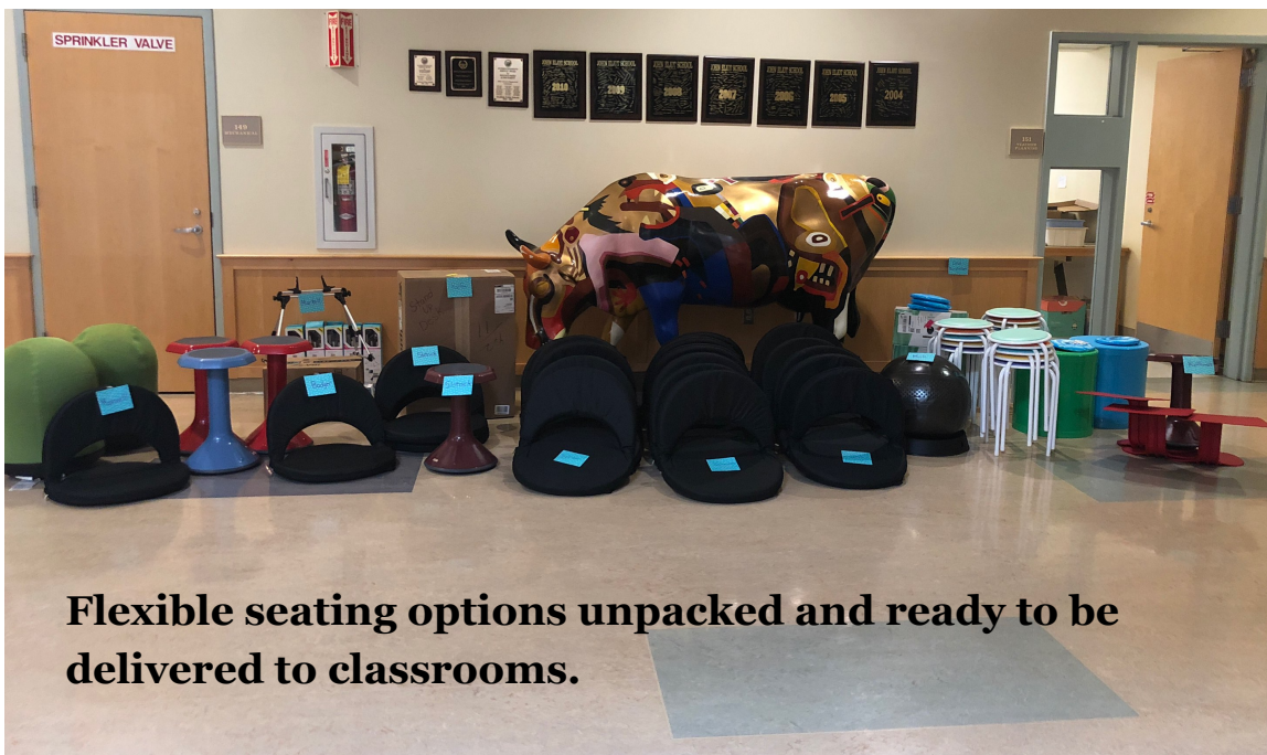
Flexible seating options unpacked and ready to be delivered to classrooms.

On Tuesday, students got a chance to watch the Sol Y Canto performance. Students danced and sang along to Latin American and Caribbean music. Sol Y Canto has performed in hundreds of schools and concerts halls as well as the White House Easter Egg Roll. The children really enjoyed the performance and we are grateful to NEF for sponsoring this event.