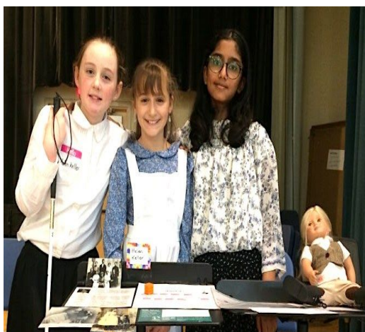
Three students chose Helen Keller as their VIP