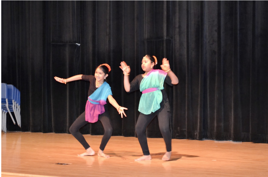
Eliot School Multicultural Night